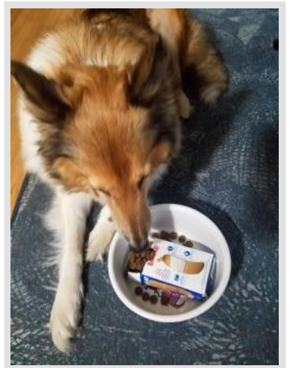
This 13-year old dog is eating her breakfast from a small box filled with kibble.