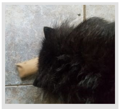
This dog is having fun trying to get kibble out of a toilet paper tube taped shut.

Enrichment is important for all species of animals, including people! Sometimes we enrich our lives and our animal's life without even noticing, such as going for walks outside or eating a yummy treat. Sometimes enrichment takes planning, such as a vacation or assembling food puzzles for your dog. Understand that what is considered enrichment should be from your dog's perspective and each dog needs to be able to choose if they want to participate or interact with the enrichment item or not. We can entice dogs to participate by offering their favorite treats or petting in their favorite spots but ultimately it will still be their choice to interact or not.