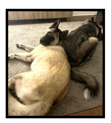
Ginger and Raiden are loving their bigger yard and home