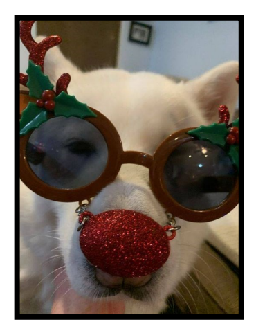
Snowbella in her Christmas gear.